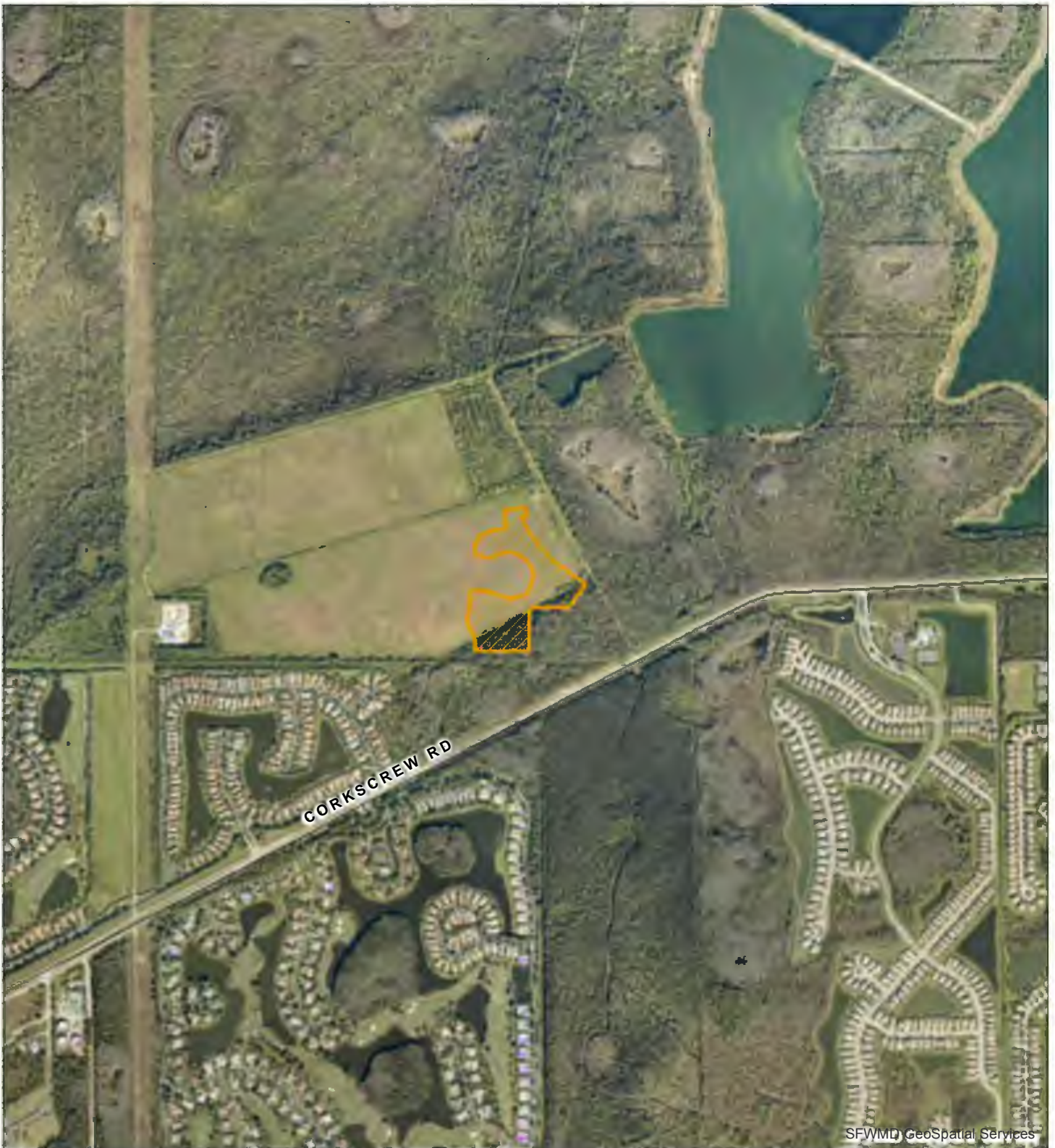
Exhibit No: 1